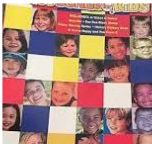
Figure 100 Songs for Kids: Easy Guitar with Notes & Tab

100 Songs for Kids - Easy Guitar with Notes & Tab , Buy the official Hal Leonard Easy Guitar with Notes & Tab, '100 Songs for Kids - Easy Guitar with Notes & Tab' (Sheet Music) halleonard.com/product/702178/100-songs-for-kids