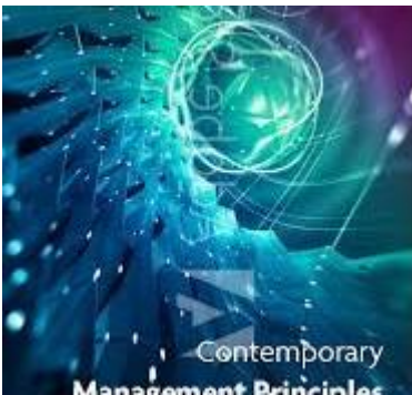
Figure Contemporary Management Principles