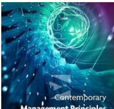
Figure Contemporary Management Principles

Contemporary Management 9th Edition Test Bank Jones ... , 3-1 Contemporary Management 9th Edition Test Bank Jones George Download all chapters TEST BANK for Contemporary Management 9th Edition by Gareth Jones, ... coursehero.com/file/29833272/354148732-Contemporary-Management-9th-Edition-Test-Bank-Jones-Georgepdf/