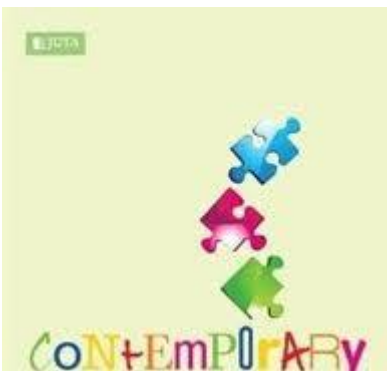
Figure Buy Contemporary management principles Book Online at Low ...