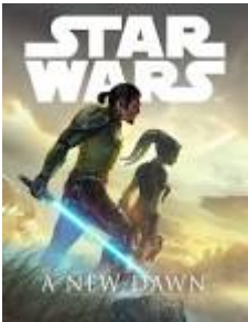
Figure Star Wars A New Dawn (official) :: Behance