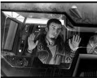
Figure A New Dawn for Star Wars Storytelling | StarWars.com

Star Wars: A New Dawn - Books - Amazon.com , 31 Mar 2015 — The first Star Wars novel created in collaboration with the Lucasfilm Story Group, Star Wars: A New Dawn is set during the legendary "Dark Times" between Episodes III and IV and tells the story of how two of the lead characters from the animated series Star Wars Rebels first came to cross paths. amazon.com/Star-Wars-John-Jackson-Miller/dp/055339147X#:~:text=Customers find the storyline good,a standalone Star Wars book