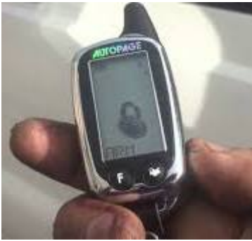
Figure Car alarm 33159

CLEAN AUTOPAGE 2-WAY XT-74 LCD REMOTE START ... , This is a great alarm remote. It has much better range than the smaller one (XT-33 IIRC) but is unfortunately quite a bit bigger. ebay com/itm/186396257661