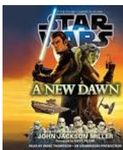
Figure A New Dawn: Star Wars