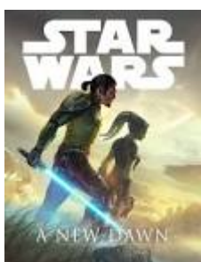
Figure Star Wars A New Dawn (official) :: Behance

A New Dawn (novel) | Wookieepedia - Fandom , A New Dawn is a canon novel written by John Jackson Miller, with a foreword by Dave Filoni. It was the first novel to be set in the current Star Wars canon, and it serves as a prequel to the animated television series Star Wars Rebels. starwars.fandom.com/wiki/A_New_Dawn_(novel)