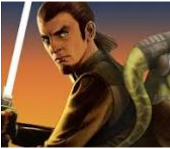
Figure Star Wars: A New Dawn Review - IGN

Star Wars: A New Dawn - Books - Amazon.com , 31 Mar 2015 — The first Star Wars novel created in collaboration with the Lucasfilm Story Group, Star Wars: A New Dawn is set during the legendary "Dark Times" between Episodes III and IV and tells the story of how two of the lead characters from the animated series Star Wars Rebels first came to cross paths. amazon.com/Star-Wars-John-Jackson-Miller/dp/055339147X#:~:text=Customers find the storyline good,a standalone Star Wars book