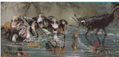
Figure RPG Writeups — Beyond the Supernatural

Figure Creature Feature™ for Beyond the Supernatural™ RPG - Palladium Books | Horror | DriveThruRPG Creature Feature™ for Beyond the Supernatural - Palladium Books , Jun 11, 2001 — Beyond the Supernatural is set in the late-eighties world of pseudo-scientific research in the paranormal. This is the kind of world the ... palladium-store.com/1001/product/704-Creature-Feature-for-Beyond-the-Supernatural.html#:~:text=Creature Feature is a journey,Some are new