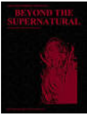
Figure Palladium Books Store 1st Edition Beyond the Supernatural ...

Beyond the Supernatural , Beyond the Supernatural is a horror role-playing game published by Palladium Books. It has seen two editions released, both of which have introduced ... en wikipedia org/wiki/Beyond_the_Supernatural