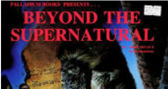
Figure Beyond the Supernatural (First Edition)

Beyond the Supernatural , Beyond the Supernatural is a horror role-playing game published by Palladium Books. It has seen two editions released, both of which have introduced ... en wikipedia org/wiki/Beyond_the_Supernatural