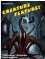
Figure Creature Feature™ for Beyond the Supernatural™ RPG - Palladium Books | Horror | DriveThruRPG Creature Feature™ for Beyond the Supernatural - Palladium Books , Jun 11, 2001 — Beyond the Supernatural is set in the late-eighties world of pseudo-scientific research in the paranormal. This is the kind of world the ... palladium-store.com/1001/product/704-Creature-Feature-for-Beyond-the-Supernatural.html#:~:text=Creature Feature is a journey,Some are new

Figure Palladium Book BEYOND THE SUPERNATURAL 2nd edition SOURCEBOOK horror RPG cryptid Beyond the Supernatural Rpg , Beyond the Supernatural Two builds on the bones of the classic BTS game to create a modern world of horror and magic unlike any before it. amazon.com/Beyond-Supernatural-Rpg-Kevin-Siembieda/dp/1574570838