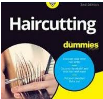
Figure Haircutting For Dummies (For Dummies (Career/Education)) PDF

Haircutting for dummies : J. Elaine Spear , 13 Aug 2013 — Haircutting for dummies. by: J. Elaine Spear. Publication date: 2002 ... DOWNLOAD OPTIONS. No suitable files to display here. IN COLLECTIONS. archive.org/details/haircuttingfordu00spea