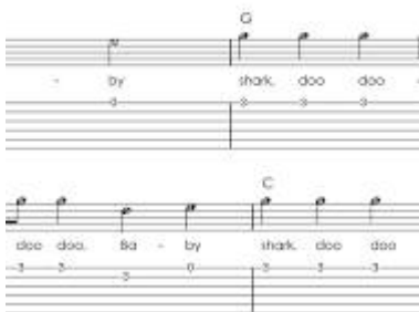
Figure First 100 Songs to Play on Guitar I Songbook for Beginners: Easy Classical Guitar Solos I Sheet Music with Letters TAB Lyrics Chords I Big Book for ...

100 Songs for Kids - Easy Guitar with Notes & Tab , Buy the official Hal Leonard Easy Guitar with Notes & Tab, '100 Songs for Kids - Easy Guitar with Notes & Tab' (Sheet Music) halleonard.com/product/702178/100-songs-for-kids