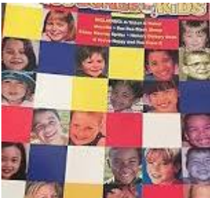
Figure 100 Songs for Kids: Easy Guitar with Notes & Tab

100 Songs for Kids - Easy Guitar with Notes & Tab , Buy the official Hal Leonard Easy Guitar with Notes & Tab, '100 Songs for Kids - Easy Guitar with Notes & Tab' (Sheet Music) halleonard.com/product/702178/100-songs-for-kids