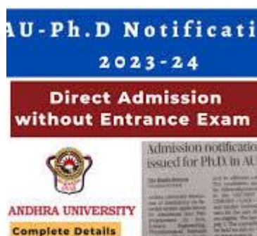
Figure Ph.D Admission Notification 2023 - Andhra University #rcet #rcet2023 #aprcet

BRS GUIDELINES - FOR M.Phil. AND Ph.D. PROGRAMMES , (a) Every candidate seeking admission to PhD Full Time or Part Time must qualify himself/herself in AURCET except those working as regular faculty in Andhra. andhrauniversity.edu.in/phd/BRS_Guidelines_10052017.pdf