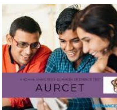
Figure AURCET/APRCET 2023: Admit Card, Exam Pattern, Exam Date ...

BRS GUIDELINES - FOR M.Phil. AND Ph.D. PROGRAMMES , (a) Every candidate seeking admission to PhD Full Time or Part Time must qualify himself/herself in AURCET except those working as regular faculty in Andhra. andhrauniversity.edu.in/phd/BRS_Guidelines_10052017.pdf