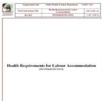
Figure ENG - DM-PHSD-P6-WI-02 Health Requirements For Labor ...

(Health+Requirements+for+Labor+Accommodation) - Free ... accommodations meet public health standards and provide a hygienic living environment sribd com/document/283691898/DM-PH-SD-P7-WI02-Health-Requirements-for-Labor-Accommodation