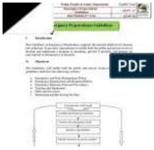
Figure DM-PH&SD-P7-WI18 - (Health Requirements For The Services ...

requirements ... dm gov ae/wp-content/uploads/2021/05/DM-HSD-GU85-LAC2-_Technical-Guidelines-for-Labor-Accommodation-Compliance_v1 1 pdf