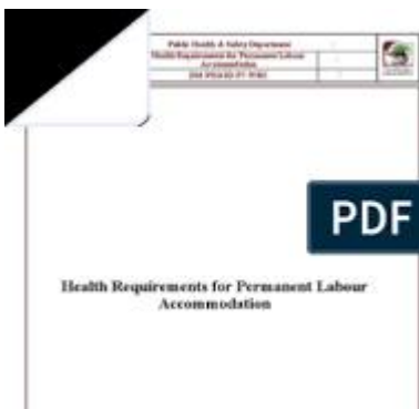
Figure Health Requirements For Permanent Labour Accommodation ...

What is the new Labour law for housemaid in UAE? Employment Conditions, Leaves, and Remuneration: Article 9 of Federal Decree-Law No. 9 of 2022 and Articles 7 and 8 of Cabinet Resolution 106 of 2022 ensure that Domestic Workers receive a paid day off every week. A daily rest period of at least 12 hours, including a continuous 8-hour sleep, is mandated.