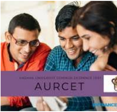
Figure AURCET/APRCET 2023: Admit Card, Exam Pattern, Exam Date ...

BRS GUIDELINES - FOR M.Phil. AND Ph.D. PROGRAMMES , (a) Every candidate seeking admission to PhD Full Time or Part Time must qualify himself/herself in AURCET except those working as regular faculty in Andhra. andhrauniversity.edu.in/phd/BRS_Guidelines_10052017.pdf