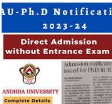
Figure Ph.D Admission Notification 2023 - Andhra University #rcet #rcet2023 #aprcet

BRS GUIDELINES - FOR M.Phil. AND Ph.D. PROGRAMMES , (a) Every candidate seeking admission to PhD Full Time or Part Time must qualify himself/herself in AURCET except those working as regular faculty in Andhra. andhrauniversity.edu.in/phd/BRS_Guidelines_10052017.pdf