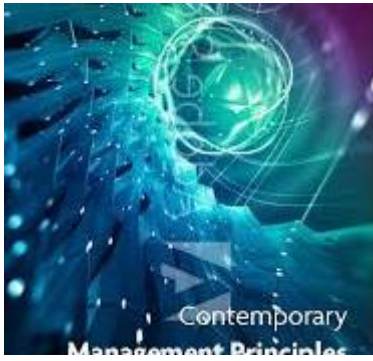
Figure Contemporary Management Principles

Essentials of Contemporary Management , library pasca unigamalang ac id/index php?p=show_detail&id=314