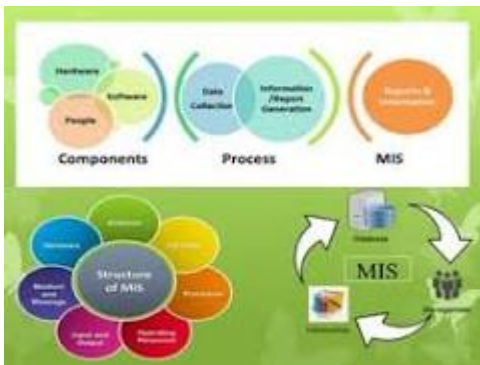
Figure Contemporary Management Practices | PPT

What is the difference between traditional and modern management practices? Traditional management styles focus on established theories like trait and situational approaches, while modern management emphasizes effectiveness in organizational reality, as per the reviewed paper.