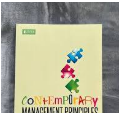
Figure Contemporary Management Principles - T Brevis and M Vrba

Contemporary Management Principles , The approach towards contemporary management principles offered in this publication integrates discussions on vital managerial competencies and skills with ... books google com/books/about/Contemporary_Management_Principles html?id=V9jfoQEACAAJ