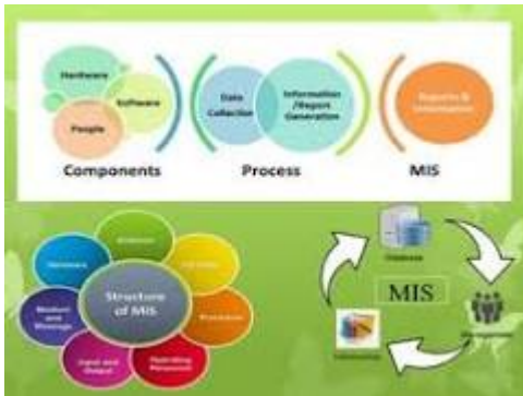
Figure Contemporary Management Practices | PPT

What is the difference between traditional and modern management practices? Traditional management styles focus on established theories like trait and situational approaches, while modern management emphasizes effectiveness in organizational reality, as per the reviewed paper.