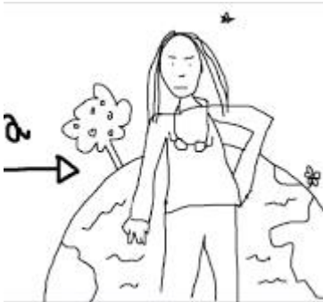
Figure A Bad Road for Cats by Cynthia Rylant

How many questions are on the CAT? The CAT 2024 will be conducted in online mode and the dates will be announced. According to the CAT exam pattern, the question paper, usually carries a total of 66 questions with 3 sections (VARC, QA, DILR). The CAT exam pattern has been modified several times in the past years by conducting IIMS.