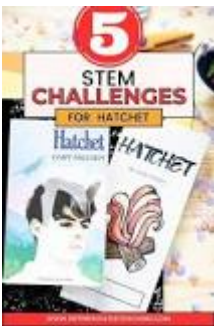
Figure 5 Epic STEM Activities for Hatchet by Gary Paulsen to ...

What happened in Chapter 1 of the hatchet? Chapter 1 of Gary Paulsen's novel Hatchet finds the main character, Brian, traveling to visit his father who is separated from his mother due to a secret his parents are unaware that he knows about when the plane he is on crashes in the Canadian wilderness.