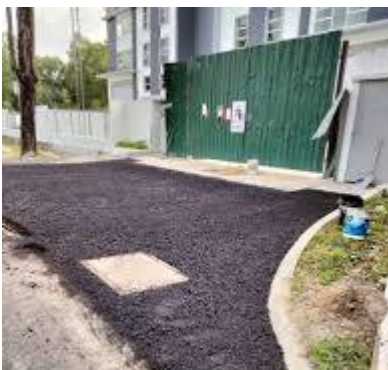
Figure ? Buat tar jalan -... - Kontraktor Penurapan Jalan Premix ...

Kos turap/tar Jalan depan rumah , 7 Mar 2012 — Just nk tanya dgn geng2 carigold. biasanya berapa kos korang tar/turap jln kt area rumah masing? smlm br turap aku kena dlm rm300 luas dlm 1.2mx2.5m jer siap dgn guna ... carigold com/forum/threads/kos-turap-tar-jalan-depan-rumah 316432/