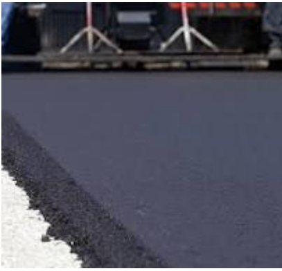
Figure Tar Jalan Selangor, Premix Jalan Malaysia, Bonggol Jalan ...

Pengiraan Kos 1m2... - Tar Jalan Dan Stamping Concrete ... , 00 untuk 1 MT jadi: kos 1m2 = panjang x lebar x tebal x ketumpatan x Harga 1 MT = Kos / m2 kos 1m2 = 0.075\text{m}^3 \times 2.3\text{ton}/\text{m}^3 \times \text{RM}166.00 = \text{RM}28.635 / \text{m}^2 (kos ACB 20 dalam m2 bagi ketebalan 75mm) Kalau Crusher Run cuma ubah ketumpatan. Jika premix guna 2.34 untuk Crusher ... facebook com/permalink php/?story_fbid=293966798741663&id=105830564221955