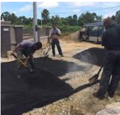
Figure Hari ini kerja-kerja menurap tar... - The Zagha Development ...

Pengiraan Kos 1m2... - Tar Jalan Dan Stamping Concrete ... , 00 untuk 1 MT jadi: kos 1m2 = panjang x lebar x tebal x ketumpatan x Harga 1 MT = Kos / m2 kos 1m2 = 0.075\text{m}^3 \times 2.3\text{ton}/\text{m}^3 \times \text{RM}166.00 = \text{RM}28.635 / \text{m}^2 (kos ACB 20 dalam m2 bagi ketebalan 75mm) Kalau Crusher Run cuma ubah ketumpatan. Jika premix guna 2.34 untuk Crusher ... facebook com/permalink php/?story_fbid=293966798741663&id=105830564221955