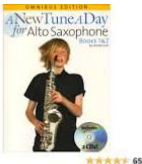
Figure A New Tune a Day: Alto Saxophone Books 1 & 2: Omnibus Edition

A New Tune a Day Alto Saxophone: Books 1 & 2 [With ... , A New Tune a Day Alto Saxophone: Books 1 & 2 [With 2 CDs and Pull-Out Fingering Chart for Alto Saxophone] (New Tune a Day (Unnumbered)) by Ned Bennett (1-Sep-2008) Paperback ... Included is a fingering chart that shows not just the fingering, but also the corresponding musical notation for that note - a note on a staff - ... amazon com/New-Tune-Day-Alto-Saxophone/dp/B012HTI7K6