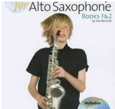
Figure A New Tune a Day: Alto Saxophone Books 1 & 2: Omnibus Edition (New Tune a Day (Unnumbered))

Importance of Computer System Validation in Pharmaceuticals , xybion com/blog/importance-of-computer-system-validation-in-the-pharmaceutical-industry/#:~:text=The purpose of CSV is,effective%2C and high%2Dquality