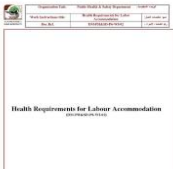
Figure ENG - DM-PHSD-P6-WI-02 Health Requirements For Labor ...

(Health+Requirements+for+Labor+Accommodation) - Free ... accommodations meet public health standards and provide a hygienic living environment scribed.com/document/283691898/DM-PH-SD-P7-WI02-Health-Requirements-for-Labor-Accommodation