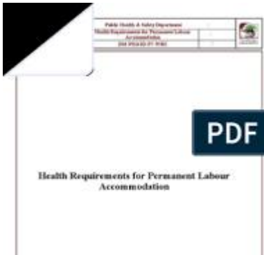
Figure Health Requirements For Permanent Labour Accommodation ...

What is the new Labour law for housemaid in UAE? Employment Conditions, Leaves, and Remuneration: Article 9 of Federal Decree-Law No. 9 of 2022 and Articles 7 and 8 of Cabinet Resolution 106 of 2022 ensure that Domestic Workers receive a paid day off every week. A daily rest period of at least 12 hours, including a continuous 8-hour sleep, is mandated.