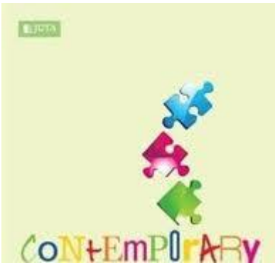
Figure Buy Contemporary management principles Book Online at Low ...