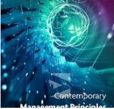
Figure Contemporary Management Principles

All you need to know about the 5P Method | Enlaps , enlaps.io/us/guide/5p-method/#:~:text=The 5P Approach presents a,objectives with efficacy and proficiency