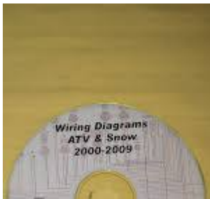
Figure Arctic Cat Wiring Diagram Service Manual 2000-2009 ATV Snowmobile ZR 500 650

Arctic Cat All Atv and Snowmobile 2000 - 2009 Wiring ... , Apr 5, 2014 — Unfortunately Country Cat only has wiring diagrams back to 2000 for sleds. I have a generic 90-98 manual for Cats and there's not an EFI harness diagram in it. tradebit.com/filedetail.php/175894842-arctic-cat-all-atv-and-snowmobile-2000