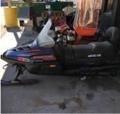
Figure 2000 Arctic Cat Bearcat 550 Widetrack Snowmobile: | Mounds ...

2015 Arctic Cat Bearcat® 2000 XTE - Snowmobile.com , Research 2002 Arctic Cat BEARCAT 550 WT - 550cc standard equipment and specifications at J.D. Power. snowmobile.com/specs/arctic-cat/utility/2015/bearcat-reg/2000-xte.html#:~:text=Fuel Mileage%2D about 7%2D12,the size of the sled