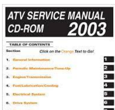
Figure 2003 Arctic Cat 500 4x4 Automatic TBX ATV Service Repair ...

2003 Arctic Cat 500 4x4 Automatic TBX ATV Service ... , 15 Oct 2017 — 2003 Arctic Cat 500 4x4 Automatic TBX ATV Service Repair Manual - Download as a PDF or view online for free. slideshare net/slideshow/2003-arctic-cat-500-4x4-automatic-tbx-atv-service-repair-manual-80838817/80838817