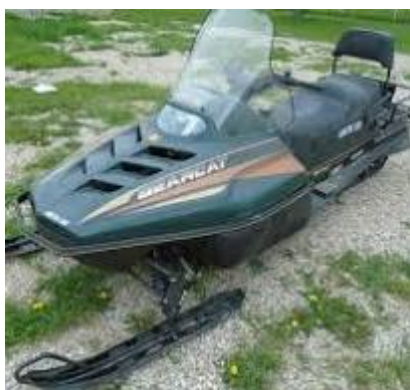
Figure 1997 Arctic Cat 550 Bearcat Snowmobile BigIron Auctions

What was the top speed of a BearCat car? With these small dimensions, the car could reach 90 mph (145 kph). In total only 10 Super Bearcats were produced. Factory production halted around 1933, leaving these cars as the swansong of one of America's great marques.