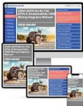
Figure 2000-2009 Arctic Cat ATVs & Snowmobiles OEM Wiring Diagrams Manual Arctic Cat Wiring Diagram Service Manual 2000-2009 ATV ... , Apr 19, 2012 — It is all Arctic Cat wiring diagrams for ATV's and snowmobiles from 2000 thru 2009. It is a big file, 459MB. ebay.com/itm/134213593446