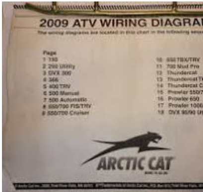
Figure 2258-411 OEM ARCTIC CAT 2009 ATV Wiring Diagrams

appropriate Main Harness Wiring Diagram and Hood Harness Wiring Diagram. arcticchat.com/threads/mega-pdf-of-all-ac-wiring-diagrams-318342/