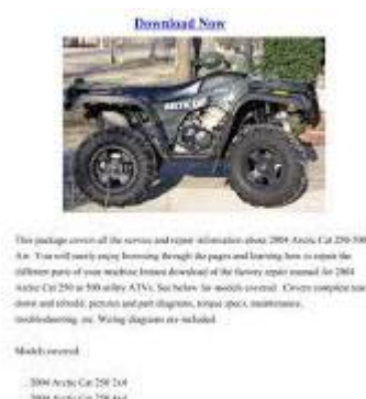
Figure Arctic Cat 250-500 Atv 2004 Service Repair Manual | PDF

2003 Arctic Cat 500 4x4 Automatic TBX ATV Service ... , 15 Oct 2017 — 2003 Arctic Cat 500 4x4 Automatic TBX ATV Service Repair Manual - Download as a PDF or view online for free. slideshare net/slideshow/2003-arctic-cat-500-4x4-automatic-tbx-atv-service-repair-manual-80838817/80838817