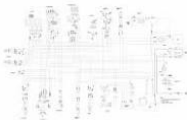
Figure 2000-2009 Arctic Cat ATVs & Snowmobiles OEM Wiring Diagrams Manual Mega PDF of all AC wiring diagrams , Jul 13, 2017 — This chart is designed to direct the technician to the