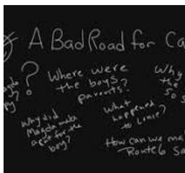
Figure The Secret Recipe for Short Stories – Word Dancer ...

Comprehension | Answering Inferential Questions , Always remember to answer the question instead of merely giving the facts for inferential question. With the given facts of "a bad road for cats" ... linkedin.com/pulse/comprehension-answering-inferential-questions-lily-chew