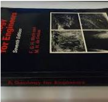
Figure A Geology for Engineers, Seventh Edition