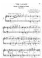
Figure Beethoven Piano Sonata 5 Library

Top 10 piano sonatas | Gramophone , Beethoven Piano Sonatas · Piano Sonata in E-flat Major, WoO 47, “Kurfürstensonata No. 1” (1783) · Piano Sonata in F Minor, WoO 47, “Kurfürstensonata No. 2”(1783). gramophone.co.uk/features/article/top-10-piano-sonatas