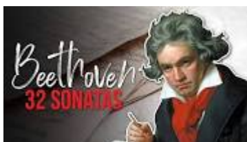
Figure The Nature of Genius: Beethoven and the Sonata Form

The Beethoven Sonatas: Where to Start? - Pianodao , Aug 22, 2022 — We look at five pianists who have recorded all 32 of Beethoven's piano sonatas: Schnabel, Barenboim, Annie Fischer, Igor Levit, and Jonathan ... pianodao.com/2021/11/26/the-beethoven-sonatas-where-to-start/#:~:text=The first Beethoven Sonata which,used in his Septet Op