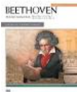
Figure Beethoven: Piano Sonatas, Volume 1 (Nos. 1-8)

Top 10 piano sonatas | Gramophone , Beethoven Piano Sonatas · Piano Sonata in E-flat Major, WoO 47, “Kurfürstensonata No. 1” (1783) · Piano Sonata in F Minor, WoO 47, “Kurfürstensonata No. 2”(1783). gramophone.co.uk/features/article/top-10-piano-sonatas