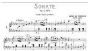
Figure Beethoven: The 32 Piano Sonatas - YouTube

The 3 Easiest Beethoven Sonatas (piano) | Da Capo Academy of Music , Mar 22, 2024 — In this article, we'll explore some of Beethoven's most well-known sonatas: “Pathétique,” “Moonlight,” “Waldstein,” “Appassionata,” and “ ... dacapomusic.ca/blog/easy-beethoven-sonatas#:~:text=G Major%2C Op -,49 No ,G Major instead of Minor