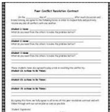
Figure Peer Conflict Resolution Contract

What are the 6 C's of conflict resolution? The theory of conflict management depicted using the Six C's model (Context, Condition, Causes, Consequences, Contingencies, and Covariance) (Glaser, 1978)