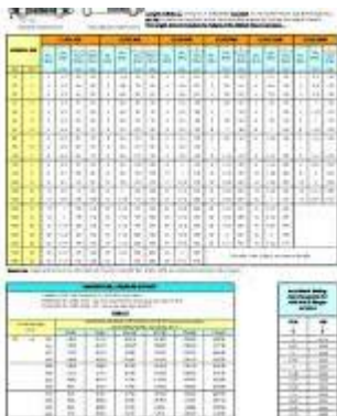
Figure PDF) Bolt stud dimensions for ansi flanges pdf | ali taher ...

What is ANSI rated flange? The ANSI Class rating of a flange is defined as the maximum amount of pressure that the flange can withstand at increasing temperatures. There are seven primary pressure classes for flanges. They are 150, 300, 400, 600, 900, 1500, and 2500.