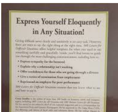
Figure 500 Letters for Difficult Situations : Easy-to-Use Templates for Challenging Communications by Janice Keefe and Corey Sandler (2010, Trade Paperback)

500 Letters for Difficult Situations eBook by Corey Sandler , Easy-to-Use Templates for Challenging Communications. By Corey Sandler. eBook ... Inside, you'll find letters to guide you through the most challenging ... simonandschuster.com/books/500-Letters-for-Difficult-Situations/Corey-Sandler/9781440507144