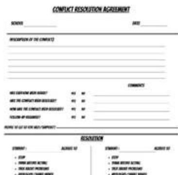
Figure Conflict resolution agreement | TPT

Conflict Resolution Contract , Student A will not communicate any information about Student B to other people. Student B will speak to Student A in a respectful and safe manner (no threats). ktufsd.org/cms/lib/NY19000262/centricity/domain/723/Conflict_Resolution_Contract_2.doc