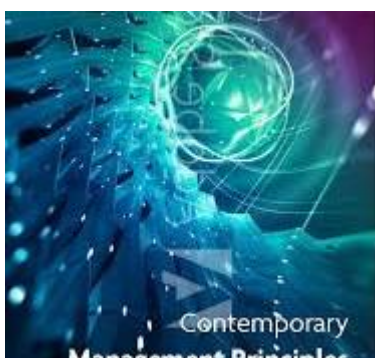
Figure Contemporary Management Principles

edu/105881621/Essentials_Of_Contemporary_Management_by_Gareth_Jones_Jennifer_George