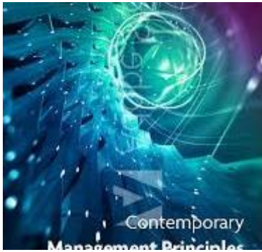
Figure Contemporary Management Principles

Contemporary Management Principles , The contemporary management principles offered in this publication integrates discussions on vital managerial competencies and skills with information on ... juta.co.za/catalogue/contemporary-management-principles-2e-print_28314