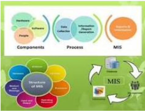
Figure Contemporary Management Practices | PPT