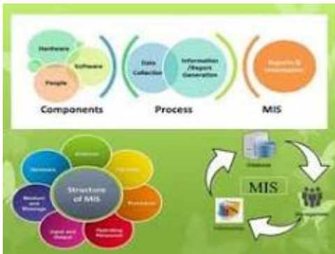
Figure Contemporary Management Practices | PPT