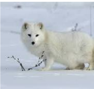
Figure How the Arctic fox survives life in the frozen North | One Earth Arctic fox , en.wikipedia.org/wiki/Arctic_fox

Interesting facts about Arctic foxes | IFAW , ifaw.org/animals/arctic-foxes#:~:text=The Arctic foxes are well,a stable 40 degrees Celsius