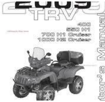
Figure Arctic Cat 2009 TRV 400 550 700 1000 H1 H2 CRUISER ATV Operation Manual 2011 ARCTIC CAT 700 ATV Service Repair Manual | PDF , 8 Feb 2023 — This Arctic Cat Service Manual contains service, maintenance, and troubleshooting information for certain 2009 Arctic Cat ATV models (see ... slideshare net/slideshow/2011-arctic-cat-700-atv-service-repair-manual/109036170 )