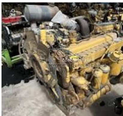
Figure Caterpillar D333 engine for Caterpillar D6C bulldozer for ...

Viewing a thread - 1970 Cat D333 Engine , 8 May 2018 — We have one in a d6c. It's turbo charged and has been a great engine. We had it since 2003 and put 300 or 400 hours a year on average. We ... talk.newagtalk.com/forums/thread-view.asp?tid=781657&DisplayType=nested#:~:text=The original D333 was probably,marine versions higher than that