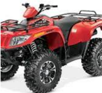
Figure 2015 Arctic Cat 1000 XT EPS - 951cc Special Notes, Prices ...

2017 Arctic Cat 1000 XT EPS WHITE (A2017AGW1PUSW) ... , Shop our large selection of 2017 Arctic Cat 1000 XT EPS WHITE (A2017AGW1PUSW) OEM Parts, original equipment manufacturer parts and more online or call at ... arcticcatpartshouse.com/oemparts/l/arc/57d19e0b87a86612c88cb358/2017-1000-xt-eps-white-a2017agw1pusw-parts