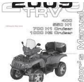
Figure Arctic Cat 2009 TRV 400 550 700 1000 H1 H2 CRUISER ATV Operation Manual

2009 Arctic Cat 550 H1 TRV 550H1TRV ATV Service ... , Arctic Cat 2009 400 TRV 500 550 700 1000 Thundercat Service Manual - Free ebook download as PDF File (.pdf), Text File (.txt) or read book online for free. slideshare net/slideshow/2009-arctic-cat-550-h1-trv-550h1trv-atv-service-repair-manual/81210531