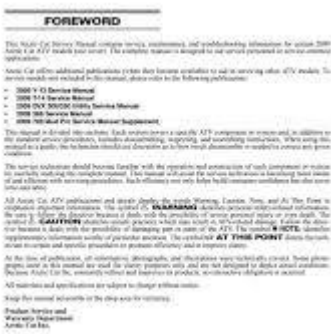
Figure 2009 Arctic Cat 550 H1 TRV 550H1TRV ATV Service Repair ...

2009 Arctic Cat 550 H1 TRV 550H1TRV ATV Service ... , Arctic Cat 2009 400 TRV 500 550 700 1000 Thundercat Service Manual - Free ebook download as PDF File (.pdf), Text File (.txt) or read book online for free. slideshare net/slideshow/2009-arctic-cat-550-h1-trv-550h1trv-atv-service-repair-manual/81210531