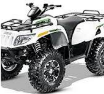
Figure 2017 Arctic Cat 1000 XT EPS - 951cc Prices and Values | J.D. ...

Arctic Fox Fact sheet | racinezoo.org , racinezoo.org/arctic-fox-fact-sheet