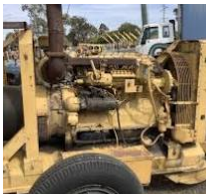
Figure Caterpillar D333 Engine - Truck & Tractor Parts & Wrecking

D333 engines - ACMOC Bulletin Board , 26 Dec 2017 — I have an old D333 engine, S/N 99G1014 that was used to power a 79B to 79B2631 genset. Parts on the exciter board failed and the engine was ... acmoc.org/bb/discussion-d72/21706-d333-engines