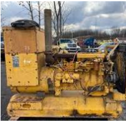
Figure Caterpillar D333-155KW Diesel Generator

Caterpillar C32 - Wikipedia , 30 Dec 2021 — One engine that was known to be a very reliable engine was the Caterpillar D333. Originally manufactured from the 1960s to 1980s it was ... en wikipedia org/wiki/Caterpillar_C32#:~:text=The C32B is the most,marine horsepower at 2300 rpm