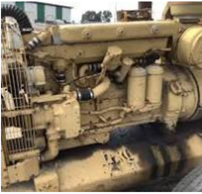
Figure Caterpillar D333 Engine - Truck & Tractor Parts & Wrecking

Caterpillar C32 - Wikipedia , 30 Dec 2021 — One engine that was known to be a very reliable engine was the Caterpillar D333. Originally manufactured from the 1960s to 1980s it was ... en wikipedia org/wiki/Caterpillar_C32#:~:text=The C32B is the most,marine horsepower at 2300 rpm