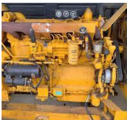
Figure CAT D333, 48184, Wayne, Michigan, United States, United States - Used diesel Generators

D333 engines - ACMOC Bulletin Board , 26 Dec 2017 — I have an old D333 engine, S/N 99G1014 that was used to power a 79B to 79B2631 genset. Parts on the exciter board failed and the engine was ... acmoc.org/bb/discussion-d72/21706-d333-engines