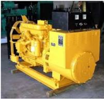
Figure Caterpillar -D333 Generator Set

Cat 3412 , This document provides specifications for various components of a diesel engine including springs, gears, valves, and torque measurements. pon-cat com/en-nl/products/cat-power-generation/oil-and-gas-engines/fire-pump-engines/cat-3412#:~:text=About the Cat 3412,FM Approved%2C UL Listed