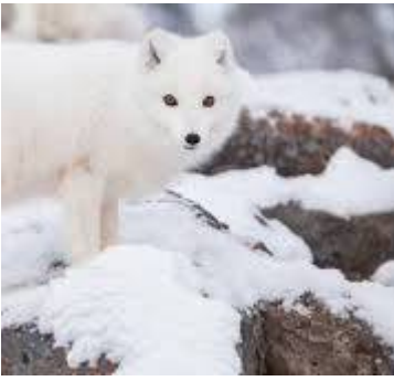
Figure Cute But Tough - The Arctic Fox - Yukon Wildlife Preserve

San Joaquin Kit Fox - Big Bear Zoo , bigbearzoo.org/services/san-joaquin-kit-fox/#:~:text=Kit foxes are the most,%2C birds%2C insects and reptiles