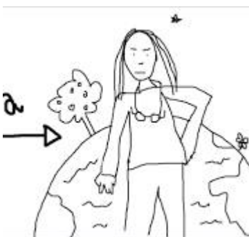
Figure A Bad Road for Cats by Cynthia Rylant

How many questions are on the CAT? The CAT 2024 will be conducted in online mode and the dates will be announced. According to the CAT exam pattern, the question paper, usually carries a total of 66 questions with 3 sections (VARC, QA, DILR). The CAT exam pattern has been modified several times in the past years by conducting IIMS.