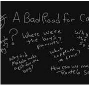
Figure The Secret Recipe for Short Stories – Word Dancer ...

Reading - Mrs. Hemler's Class , Click the button to view the text of A Bad Road for Cats by Cynthia Rylant. Think about the following questions: 1. What information did the author provide in ... mrsheimlersclass.com/reading.html