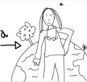
Figure A Bad Road for Cats by Cynthia Rylant

Comprehension | Answering Inferential Questions , Always remember to answer the question instead of merely giving the facts for inferential question. With the given facts of "a bad road for cats" ... linkedin.com/pulse/comprehension-answering-inferential-questions-lily-chew