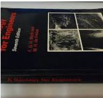
Figure A Geology for Engineers, Seventh Edition