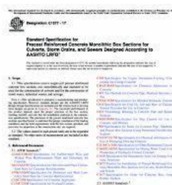
Figure ASTM C1577-17

What is ASTM D 257 standard? Understanding ASTM D257 It's used to measure the DC resistance or conductance of insulating materials. The standard is particularly important for determining surface and volume resistivity. These measurements provide insights into how well a material can resist electrical current.