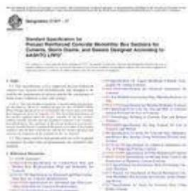
Figure ASTM C1577-17

ASTM C1577-20 - iTeh Standards , This specification covers single-cell precast reinforced concrete box sections cast monolithically and intended to be used for the construction of culverts and ... cdn standards iteh ai/samples/107699/b3cabe55a0414135a7cfad7377d3ccb5/ASTM-C1577-20.pdf