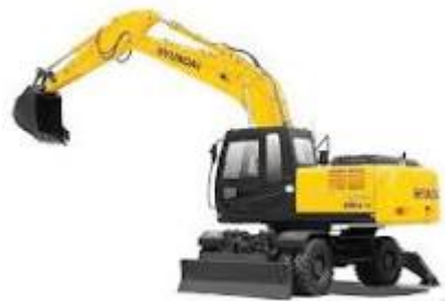
Figure Hyundai Robex 200W-7A / R200W-7A Wheel Excavator Repai Hyundai r200w 7a wheel excavator service repair ... , Mar 15, 2017 — This Service Manual has easy-to-read text sections with top quality diagrams and instructions. Trust Hyundai R200W-7A Wheel Excavator Service ... issuu.com/ksmef78/docs/hyundai_r200w-7a_wheel_excavator_se