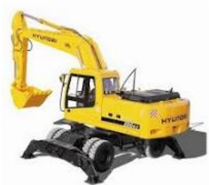
Figure Hyundai Robex 200W-7 / R200W-7 Wheel Excavator Repair Service Manual Hyundai R200W-7A Service Manual , This Hyundai Robex Construction Equipment repair manual contains workshop service manual for mechatronic system, specifications, operation principle, ... heavymanuals.com/index.php?route=product/product&product_id=60148

What is the purpose of the excavator truck? In simple terms, excavators are large industrial machines used to move large amounts of material, like rock and soil. That means they do everything from digging a basement to laying pipe to mining.