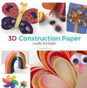
Figure Easy 3D Paper Crafts for Kids To Make

Introducing Paper Toile! - YouTube , m youtube com/watch?v=tOcTrVDjXKo