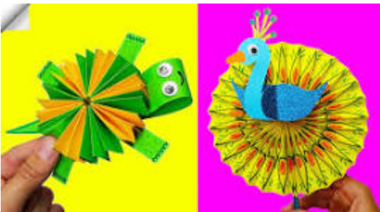
Figure 3d paper toys - 6 easy moving paper craft

Construction Paper Crafts for Kids , 3D Paper Sun - How to Make a Sun from Paper Step-by-Step - Construction Paper Crafts for Kids! Twitchetts. youtube.com/playlist?list=PLWOpD_dYvU0xZtN-9lVGqTbpGEAzS1YVE