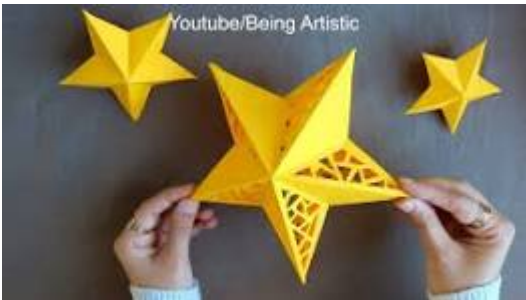
Figure How To Make an Easy 3D Paper Star - DIY Paper Star - Paper Craft

Easy Paper Crafts for Kids and Adults , Make some fun and easy paper decorations and crafts for all your seasonal celebrations! Great projects to for all kids and adults! redtedart com/paper-crafts/