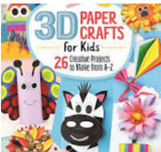
Figure 3D Paper Crafts for Kids: 26 Creative Projects to Make from A–Z (Happy Fox Books) Practice the ABCs while Making Adorable Giraffes, Kites, Apples, ... 3D Paper Crafts For Kids , When kids create in 3D it adds a fun twist to the project. These paper projects are great for little fingers and each 3D paper craft has a wow factor. pinterest.com/twitchetts/3d-paper-crafts-for-kids/