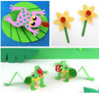
Figure 3D printable crafts - The Craft Train 25+ 3D Paper Crafts for Kids , 3D Mini Beast Crafts for Kids · Bobble Butterfly Craft · Bobble Bee Paper Craft · The Very Hungry Caterpillar Printable Craft · Peek-a-Boo Snail Craft for Kids. artycraftykids.com/craft/25-3d-paper-crafts-for-kids/