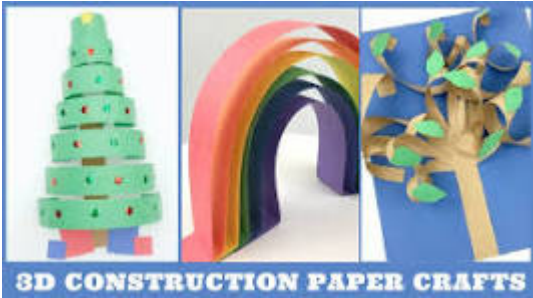
Figure 60 Easy 3D Paper Crafts for Kids To Make - Twitchetts

280 3D Paper Crafts ? ideas in 2024 , 3D Paper Crafts ? · How to Make Paper Flowers · 50+ Easy DIY Christmas Clothespin Wreath Ideas to Deck Your Doors This Winter · Healthy Peanut Butter Ice Cream ( ... pinterest com/CraftParade/3d-paper-crafts/