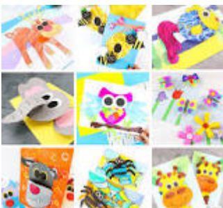
Figure 25+ 3D Paper Crafts for Kids - Arty Crafty Kids 3D Paper Crafts , It's easy to add some 3-dimensional shape to paper with simple techniques. Each of the projects in this index features one or more paper-shaping techniques. auntannie.com/3DCrafts/