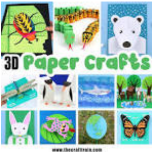
Figure 3D printable crafts - The Craft Train

30 Things to Do with a Piece of Paper | Fab English ideas , fabenglish-ideas.com/workshops/30-things-to-do-with-a-piece-of-paper/