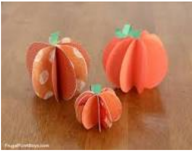
Figure How to Make 3D Paper Pumpkins - Frugal Fun For Boys and Girls

280 3D Paper Crafts ? ideas in 2024 , 3D Paper Crafts ? · How to Make Paper Flowers · 50+ Easy DIY Christmas Clothespin Wreath Ideas to Deck Your Doors This Winter · Healthy Peanut Butter Ice Cream ( ... pinterest com/CraftParade/3d-paper-crafts/