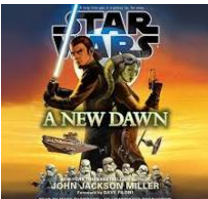
Figure A New Dawn: Star Wars