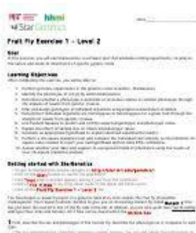
Figure fruit fly exercise 1 level 1 ver5 - Name StarGenetics Fruit ...

Why did scientists select fruit flies for his genetics experiments? Morgan worked with the tiny fruit flies, Drosophila melanogaster . Drosophila was a good model for genetic studies due to many reasons. They could be grown on simple synthetic medium in the laboratory. They complete their life cycle in about two weeks, and a single mating could produce a large number of progeny flies.