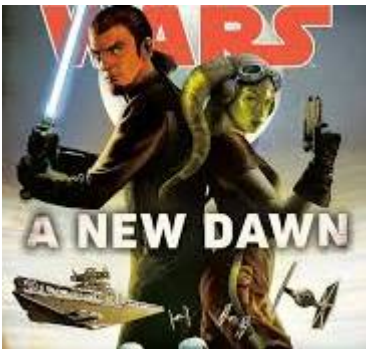
Figure A New Dawn: Star Wars