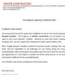
Figure Mohite Construction: Civil Engineer Experience Certificate ... Experience Certificate For Civil Engineer | PDF , Experience Certificate for Civil Engineer - Free download as Word Doc (.doc / .docx), PDF File (.pdf), Text File (.txt) or read online for free. scribd.com/document/633785288/Experience-Certificate-for-Civil-Engineer

How do I introduce myself as a civil engineer?