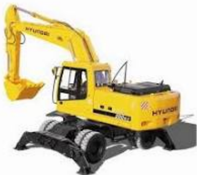
Figure Hyundai Robex 200W-7 / R200W-7 Wheel Excavator Repair Service Manual Hyundai R200W-7A Service Manual , This Hyundai Robex Construction Equipment repair manual contains workshop service manual for mechatronic system, specifications, operation principle, ...

What is the purpose of the excavator truck? In simple terms, excavators are large industrial machines used to move large amounts of material, like rock and soil. That means they do everything from digging a basement to laying pipe to mining.