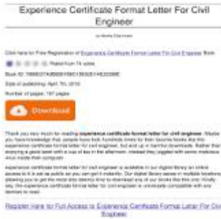
Figure Work Experience Certificate For Civil Engineer Pdf - Fill Online, Printable, Fillable, Blank | pdfFiller Mohite Construction: Civil Engineer Experience Certificate ... , Civil engineer experience certificate letter. To whom it may concern. We are proud to ... Experience Letter Format. Document 1 page. Experience Letter Format. scribd.com/document/456112606/New-Microsoft-Office-Word-Docx