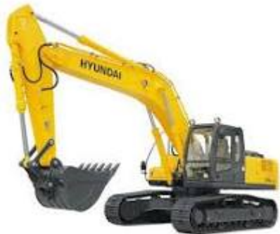
Figure Hyundai Robex 290LC-7A / R290LC-7A Crawler Excavator Repair Service Manual

Hyundai r200w 7a wheel excavator service repair ... , Mar 15, 2017 — This Service Manual has easy-to-read text sections with top quality diagrams and instructions. Trust Hyundai R200W-7A Wheel Excavator Service ... issuu.com/ksmef78/docs/hyundai_r200w-7a_wheel_excavator_se