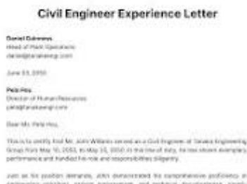
Figure Civil Engineer Experience Letter Template - Edit Online ...

Junior Civil Engineer Experience Certificate Format, 7 Oct 2022 — Sample Experience Certificate Format 1 ... This is to certify that Mr. /Ms. (employee name) worked as an employee of this organization from (date ... testbook.com/junior-engineer-civil-govt-jobs/junior-civil-engineer-experience-certificate-format