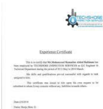
Figure Q.C Engineer Experience Certificate from Techshore | PDF

Junior Civil Engineer Experience Certificate Format, 7 Oct 2022 — Sample Experience Certificate Format 1 ... This is to certify that Mr. /Ms. (employee name) worked as an employee of this organization from (date ... testbook.com/junior-engineer-civil-govt-jobs/junior-civil-engineer-experience-certificate-format