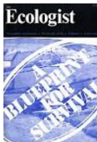
Figure 'A Blueprint for Survival', The Ecologist (1972) – 'A Book in ...

Blueprint for survival , Blueprint for survival ; Person as author. Goldsmith, Edward ; Main topic. Human ecology. Environmental management. Social systems ; Geographic topic. USA ; Notes. unesdoc.unesco.org/ark:/48223/pf0000007853