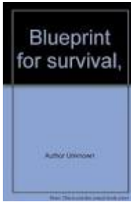
Figure Blueprint for survival,

Basic Cave Diving: A Blueprint for Survival , The NSS-CDS is excited to announce that Sheck Exley's Basic Cave Diving: A Blueprint for Survival is now available free of charge. Please click on the image to ... nsscds.org/blueprint-for-survival/