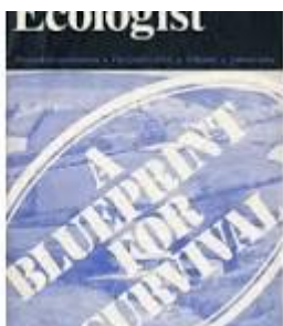
Figure The Ecologist January 1972: a blueprint for survival

A Blueprint for Survival , A Blueprint for Survival was an influential environmentalist text that drew attention to the urgency and magnitude of environmental problems. en wikipedia org/wiki/A_Blueprint_for_Survival