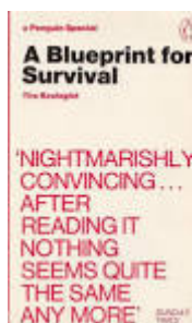
Figure A Blueprint for Survival - Wikipedia

communications_corey-sandler/1092618/?srsltid=AfmBOooYOvjjvLTtWB4q9M6t09MOLMWfpAUOrqg-uS_o9FVpZJQ5v6U2