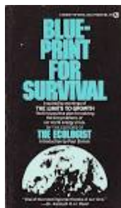
Figure Blueprint for Survival: Goldsmith, Edward: 9780451060266 ...

The Ecologist January 1972: a blueprint for survival , 27 Jan 2012 — Forty years ago the Ecologist published its landmark 'A Blueprint for Survival' issue outlining the need for a serious economic and ... theecologist.org/2012/jan/27/ecologist-january-1972-blueprint-survival