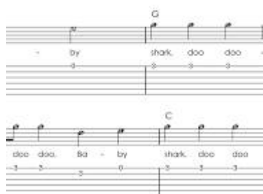
Figure First 100 Songs to Play on Guitar I Songbook for Beginners: Easy Classical Guitar Solos I Sheet Music with Letters TAB Lyrics Chords I Big Book for ...

100 Songs for Kids - Easy Guitar with Notes & Tab , Buy the official Hal Leonard Easy Guitar with Notes & Tab, '100 Songs for Kids - Easy Guitar with Notes & Tab' (Sheet Music) halleonard.com/product/702178/100-songs-for-kids