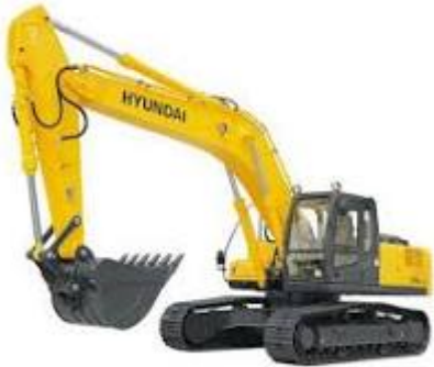
Figure Hyundai Robex 290LC-7A / R290LC-7A Crawler Excavator Repair Service Manual HYUNDAI ROBEX R200W-2 WHEEL Excavator Service ... , HYUNDAI ROBEX R200W-2 WHEEL Excavator Service Manual book repair shop book guide ; Condition. Acceptable ; Quantity. 1 available ; Item Number. 195453247866. ebay.com/itm/195453247866

Hyundai r200w 7a wheel excavator service repair ... , Mar 15, 2017 — This Service Manual has easy-to-read text sections with top quality diagrams and instructions. Trust Hyundai R200W-7A Wheel Excavator Service ... issuu.com/ksmef78/docs/hyundai_r200w-7a_wheel_excavator_se