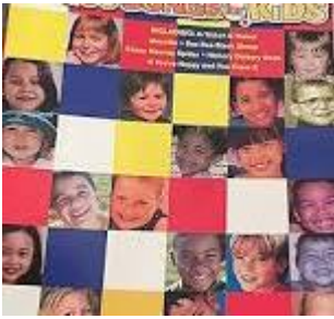
Figure 100 Songs for Kids: Easy Guitar with Notes & Tab

100-Songs-For-Kids-Easy-Guitar-Songbook.pdf , 100 SONGS & KIDS. STRUM AND PICK PATTERNS .4. Frog Went A-Courtin' .38. A-Hunting ... TAB ?? . X. Esus4. 123. A7/G. 00 ?? . 1 2. D/F# ?? . TO. 00. Bm/A ?? . 132. A/E. http://ecauxmusical.fr/wp-content/uploads/2020/03/100-Songs-For-Kids-Easy-Guitar-Songbook.pdf