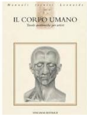
Figure Vinciana Editrice - Il corpo umano - Tavole anatomiche per ...

Il corpo umano. Tavole anatomiche per artisti - Libri , Panoramica del libro. "Se l'artista non ha una esatta cognizione dello scheletro, corre rischio di collocare fuori sito le ossa e le membra; laddove bozzando ... amazon it/corpo-umano-Tavole-anatomiche-artisti/dp/8886256841