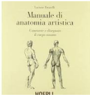
Figure Amazon.it: Il corpo umano. Tavole anatomiche per artisti - Libri

IL CORPO UMANO - tavole anatomiche per artisti , Ogni singola tavola presenta la numerazione, l'indicazione della parte illustrata e la sua nomenclatura anatomica; in tal modo l'utilizzo delle tavole è ... poggil825 it/prodotto/il-corpo-umano-tavole-anatomiche-per-artisti-collana-leonardo-7260011/