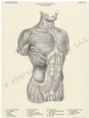
Figure Vinciana Editrice - Il corpo umano - Tavole anatomiche per ...

Il corpo umano. Tavole anatomiche per artisti - Libri , Panoramica del libro. "Se l'artista non ha una esatta cognizione dello scheletro, corre rischio di collocare fuori sito le ossa e le membra; laddove bozzando ... amazon it/corpo-umano-Tavole-anatomiche-artisti/dp/8886256841