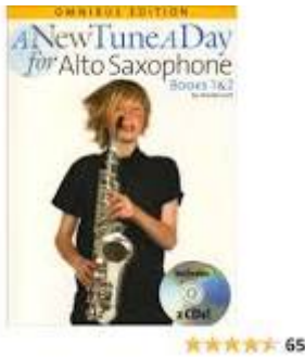
Figure A New Tune a Day: Alto Saxophone Books 1 & 2: Omnibus Edition

& 2 [With 2 CDs and Pull-Out Fingering Chart for Alto Saxophone] (New Tune a Day (Unnumbered)) by Ned Bennett (1-Sep-2008) Paperback ... Included is a fingering chart that shows not just the fingering, but also the corresponding musical notation for that note - a note on a staff - ... amazon.com/New-Tune-Day-Alto-Saxophone/dp/B012HTI7K6