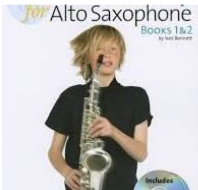
Figure A New Tune a Day: Alto Saxophone Books 1 & 2: Omnibus Edition (New Tune a Day (Unnumbered))

How does water dowsing work? - West Texas A&M University , wtamu edu/~cbaird/sq/2015/04/15/how-does-water-dowsing-work/#:~:text=The dowsing rods do indeed,amplified into a big movement