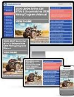
Figure 2000-2009 Arctic Cat ATVs & Snowmobiles OEM Wiring Diagrams Manual Arctic Cat Wiring Diagram Service Manual 2000-2009 ATV ... , Apr 19, 2012 — It is all Arctic Cat wiring diagrams for ATV's and snowmobiles from 2000 thru 2009. It is a big file, 459MB. ebay.com/itm/134213593446