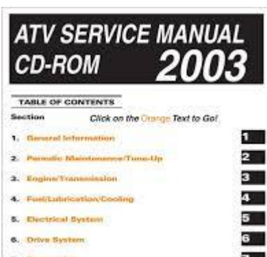
Figure 2003 Arctic Cat 500 4x4 Automatic TBX ATV Service Repair ...

2003 Arctic Cat 500 4x4 Automatic TBX ATV Service ... , 15 Oct 2017 — 2003 Arctic Cat 500 4x4 Automatic TBX ATV Service Repair Manual - Download as a PDF or view online for free. slideshare net/slideshow/2003-arctic-cat-500-4x4-automatic-tbx-atv-service-repair-manual-80838817/80838817