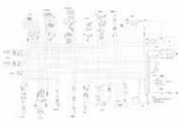
Figure 2000-2009 Arctic Cat ATVs & Snowmobiles OEM Wiring Diagrams Manual Mega PDF of all AC wiring diagrams , Jul 13, 2017 — This chart is designed to direct the technician to the appropriate Main Harness Wiring Diagram and Hood Harness Wiring Diagram. arcticchat.com/threads/mega-pdf-of-all-ac-wiring-diagrams 318342/