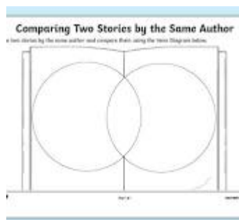
Figure Comparing Two Stories By The Same Author Worksheet

Compare & Contrast - Grade 3 Children's Book Collection , Some well-known examples of book series are The Magic Tree House series by Mary Pope Osborne, The Diary of a Wimpy Kid series by Jeff Kinney, Clifford the Big ... getepic.com/collection/27603041/compare-contrast-grade-3