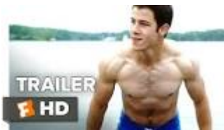
Figure Careful What You Wish For Official Trailer #1 (2016) - Nick Jonas, Isabel Lucas Movie HD

Be Careful What You Wish For | Psychology Today , psychologytoday.com/intl/blog/mindfully-present-fully-alive/201807/be-careful-what-you-wish#:~:text=If we aren't careful,we acquire what we desire