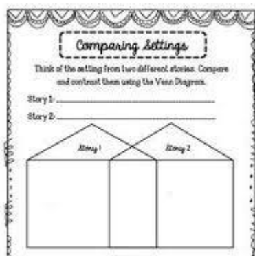
Figure RL3.9 Compare and Contrast Stories by the Same Author ...

Compare & Contrast - Grade 3 Children's Book Collection , Some well-known examples of book series are The Magic Tree House series by Mary Pope Osborne, The Diary of a Wimpy Kid series by Jeff Kinney, Clifford the Big ... getepic.com/collection/27603041/compare-contrast-grade-3