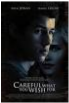
Figure Careful What You Wish For (film) - Wikipedia

Be careful what you wish for, lest it come true! - Soap Creative, Complications arise when a young man (Nick Jonas) has an affair with the seductive wife (Isabel Lucas) of an investment banker (Dermot Mulroney). soapcreative.co.uk/stories/be-careful-what-you-wish-for-lest-it-come-true/#:~:text=The origin of this saying,known collection of morality tales