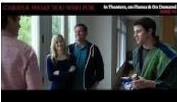
Figure Careful What You Wish For (2015) - IMDb

Be careful what you wish for, lest it come true! - Soap Creative, Complications arise when a young man (Nick Jonas) has an affair with the seductive wife (Isabel Lucas) of an investment banker (Dermot Mulroney). soapcreative.co.uk/stories/be-careful-what-you-wish-for-lest-it-come-true/#:~:text=The origin of this saying,known collection of morality tales