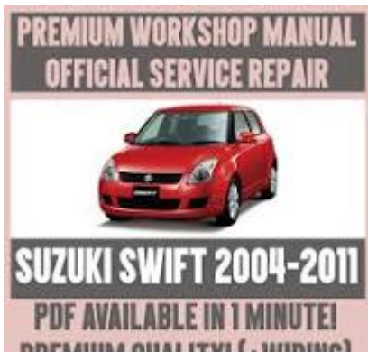
Figure WORKSHOP MANUAL SERVICE & REPAIR GUIDE for SUZUKI SWIFT 2004-2011 +WIRING Suzuki Swift RS413 RS415 Factory Service Repair Manual , This manual contains factory service and repair procedure for the SUZUKI SWIFT Rs413/Rs415 (Year: 2004, 2005, 2006, 2007, 2008, 2009, 2010). pinterest.com/pin/suzuki-swift-rs413-rs415-factory-service-repair-manual--953426183604211617/

2004-2007 Service Manual , MANUAL LIST. HOW TO FIND APPLICABLE MANUALS. VIN TABLE. MANUAL LIST. Manual group. Manual Part Name. Language. Manual Part Number. (1). SWIFT (RS413/RS415) jdmsfm.info/Auto/Japan/Suzuki/Swift/2004-2007 Service Manual/