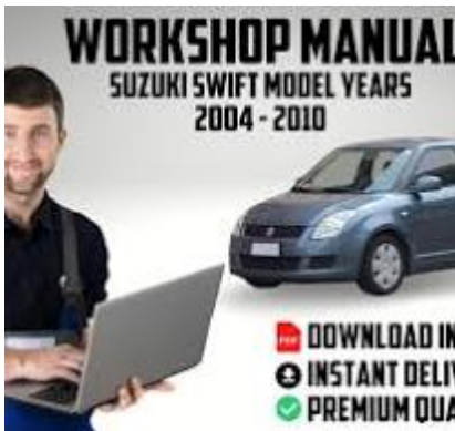
Figure Official Factory Workshop Service Repair Car Fix Manual ...

2004-2007 Service Manual , MANUAL LIST. HOW TO FIND APPLICABLE MANUALS. VIN TABLE. MANUAL LIST. Manual group. Manual Part Name. Language. Manual Part Number. (1). SWIFT (RS413/RS415) jdmsfm.info/Auto/Japan/Suzuki/Swift/2004-2007 Service Manual/