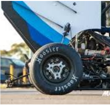
Figure Design and Development of Carbon Fibre Wheel Shells and ...

Composite Suspension for Formula SAE Vehicle , by R Olsen · 2010 · Cited by 9 — This senior project report describes how a redesign of the 2008 Cal Poly Formula SAE vehicle's suspension components was conducted using carbon fiber components ... digitalcommons calpoly edu/mesp/40/