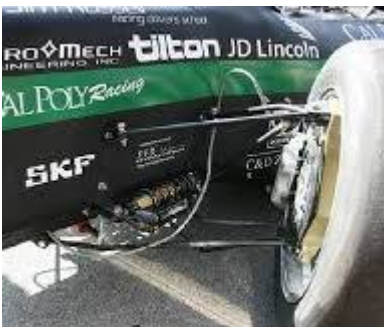
Figure 1: Broken Suspension Components

What does SAE mean in accounting? The sales to administrative expense ratio (SAE) is a financial metric that assesses a company's ability to handle its non-operating expense to help other operations to bring in more sales. Simply put, if you are managing your fixed costs well, you should have smooth day-to-day operations.