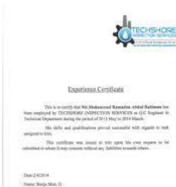
Figure Q.C Engineer Experience Certificate from Techshore | PDF Experience Certificate for Engineer - Format, Sample & ... , 5+ Free Sample Format of Experience Certificate for Engineer with Various Example have been given here in this article in PDF & Word format. dk.pinterest.com/pin/experience-certificate-for-engineer-format-sample-example--685110162113571767/