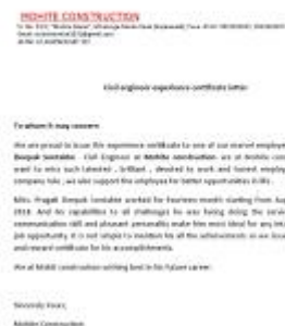
Figure Mohite Construction: Civil Engineer Experience Certificate ... Experience Certificate For Civil Engineer | PDF , Experience Certificate for Civil Engineer - Free download as Word Doc (.doc / .docx), PDF File (.pdf), Text File (.txt) or read online for free. scribd.com/document/633785288/Experience-Certificate-for-Civil-Engineer

How do I introduce myself as a civil engineer?