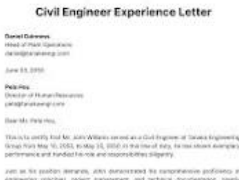
Figure Civil Engineer Experience Letter Template - Edit Online ... Junior Civil Engineer Experience Certificate Format, 7 Oct 2022 — Sample Experience Certificate Format 1 ... This is to certify that Mr. /Ms. (employee name) worked as an employee of this organization from (date ... testbook.com/junior-engineer-civil-govt-jobs/junior-civil-engineer-experience-certificate-format