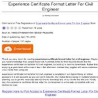
Figure Work Experience Certificate For Civil Engineer Pdf - Fill Online, Printable, Fillable, Blank | pdfFiller Mohite Construction: Civil Engineer Experience Certificate ... , Civil engineer experience certificate letter. To whom it may concern. We are proud to ... Experience Letter Format. Document 1 page. Experience Letter Format. scribd.com/document/456112606/New-Microsoft-Office-Word-Document-docx