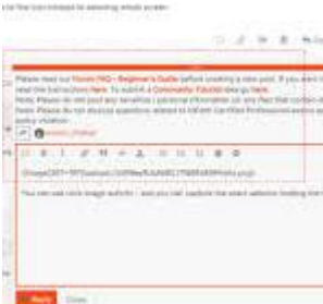
Figure Unable to click export icon in SAP - Activities - UiPath ...

Download Icon Image File To Pc Sap Practical Tips For Beginner ... , Download Icon Image File To Pc Sap Practical Tips For Beginner Hans Sap Manual Book. 1. Download Icon Image File To Pc Sap Practical Tips For Beginner Hans ... ev fpune edu py/viewcontent?redir_esc=16700&FileName=Download Icon Image File To Pc Sap Practical Tips For Beginner Hans Sap Manual Book pdf