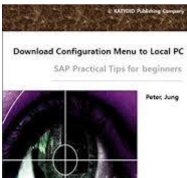
Figure Download IMG Configuration Menu: SAP Practical Tips for beginner (HAN's SAP Manual Book)

About Form W-4, Employee's Withholding Certificate - IRS , irs.gov/forms-pubs/about-form-w-4#:~:text=Complete Form W%2D4 so, personal or financial situation changes