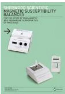
Figure SHERWOOD SCIENTIFIC MAGNETIC SUSCEPTIBILITY BALANCES

What is the most likely cause of this susceptibility artifact? This artifact is caused by the magnetic field inhomogeneity generated by the magnetic properties of certain materials, such as metallic implants and hemorrhage. Magnetic susceptibility artifact can cause several imaging artifacts, such as geometric distortion, signal dropout, and blooming artifact.