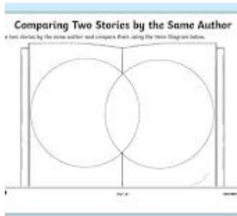
Figure Comparing Two Stories By The Same Author Worksheet

Compare & Contrast - Grade 3 Children's Book Collection , Some well-known examples of book series are The Magic Tree House series by Mary Pope Osborne, The Diary of a Wimpy Kid series by Jeff Kinney, Clifford the Big ... getepic.com/collection/27603041/compare-contrast-grade-3