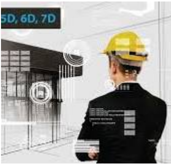
Figure What are BIM Dimensions – 3D, 4D, 5D, 6D, and 7D BIM?

3D, 4D, and 5D Engineered Models for Construction , This Technical Brief provides an overview of 3D modeling, including technology applications during design and construction, benefits to stakeholders, resource. fhwa dot gov/construction/pubs/hif13048 pdf