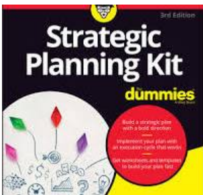
Figure Strategic Planning Kit For Dummies, 3rd Edition | Wiley