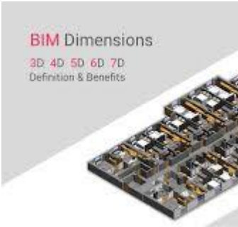
Figure What are BIM Dimensions? - 3D, 4D, 5D, 6D, and 7D

3D, 4D, and 5D Engineered Models for Construction , This Technical Brief provides an overview of 3D modeling, including technology applications during design and construction, benefits to stakeholders, resource. fhwa dot gov/construction/pubs/hif13048 pdf