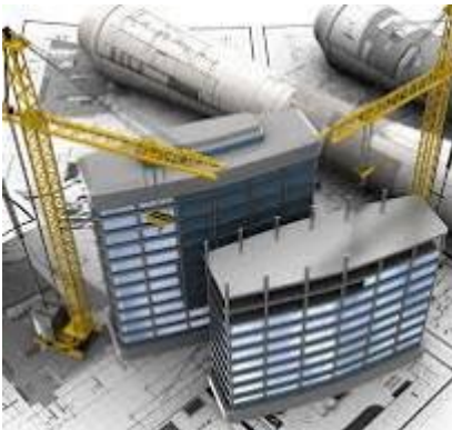
Figure Facts about 4D, 5D and 6D BIM technology that are guaranteed ...

What are BIM Dimensions – 3D, 4D, 5D, 6D, and 7D BIM? , This Technical Brief provides an overview of 3D modeling, including technology applications during design and construction, benefits to stakeholders, ... monarch-innovation com/bim-dimensions-3d-4d-5d-6d-7d#:~:text=3D BIM%3A Represents the spatial,accurate cost estimation and budgeting