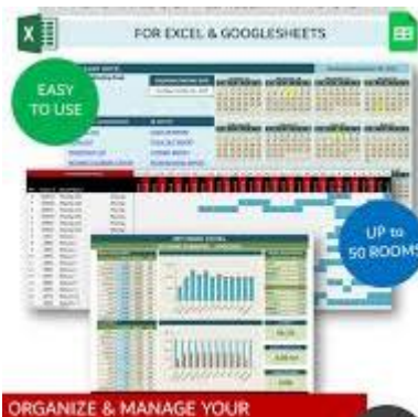
Figure Hotel Booking System Template Hotel Reservation Spreadsheet ...

Hotel and Hotel Apartments Bookings Calendar Excel Google ... , youtube com/watch?v=jMUg6_TEnkQ