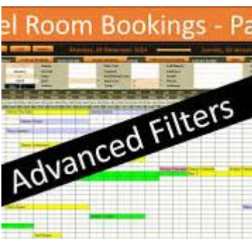
Figure Excel Room Bookings Advanced Filters

BedBooking - reservation calendar, vacation rental software ... , bed-booking com/