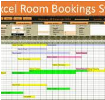
Figure Excel Room Bookings Calendar

Time Excelindo , 20 Apr 2021 — Sure bro! This is perfect for me...See the only thing I was struggling with was getting the dates in between the check-in/out to show as booked on Jeff's calendar. That was crucial for me. In the end I found a sheet formula instead of script for it...The other thing was the nights...when you deduct the in ... excelindo co id/