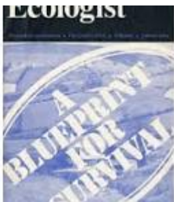
Figure The Ecologist January 1972: a blueprint for survival

A Blueprint for Survival , A Blueprint for Survival was an influential environmentalist text that drew attention to the urgency and magnitude of environmental problems. en.wikipedia.org/wiki/A_Blueprint_for_Survival