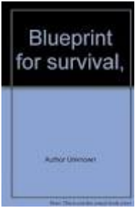
Figure Blueprint for survival,

A Blueprint for survival, (A Penguin special), 'A Blueprint for Survival' published as a paperback way back in 1972, is the closest the Green Party of England and Wales has to a birth certificate. amazon.com/Blueprint-survival-Penguin-special/dp/0140522956