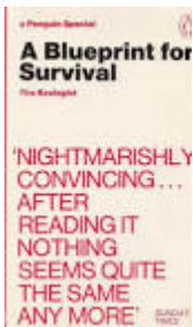
Figure A Blueprint for Survival - Wikipedia

Laser Cutting Basics : 15 Steps (with Pictures) , A laser cutter is a prototyping and manufacturing tool used primarily by engineers, designers, and artists to cut and etch into flat material. instructables.com/Laser-Cutting-Basics/