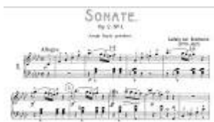
Figure Beethoven: The 32 Piano Sonatas - YouTube

The 3 Easiest Beethoven Sonatas (piano) | Da Capo Academy of Music , Mar 22, 2024 — In this article, we'll explore some of Beethoven's most well-known sonatas: "Pathétique," "Moonlight," "Waldstein," "Appassionata," and " ... dacapomusic.ca/blog/easy-beethoven-sonatas/#:~:text=G Major%2C Op -,49 No ,G Major instead of Minor