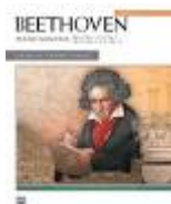
Figure Beethoven: Piano Sonatas, Volume 1 (Nos. 1-8)

Piano sonatas (Beethoven) - Wikipedia , All 32 sonatas from volumes one and two (edited by Von Bülow/Lebert) have been combined into one, gigantic comb-bound volume. 696 pages. en wikipedia.org/wiki/Piano_sonatas_(Beethoven)#:~:text=Yet again%2C his music found,Beethoven's most difficult sonata yet