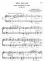
Figure Beethoven Piano Sonata 5 Library