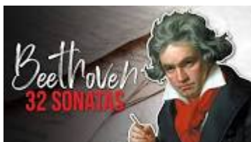
Figure The Nature of Genius: Beethoven and the Sonata Form

The Beethoven Sonatas: Where to Start? - Pianodao , Aug 22, 2022 — We look at five pianists who have recorded all 32 of Beethoven's piano sonatas: Schnabel, Barenboim, Annie Fischer, Igor Levit, and Jonathan ... pianodao.com/2021/11/26/the-beethoven-sonatas-where-to-start/#:~:text=The first Beethoven Sonata which,used in his Septet Op