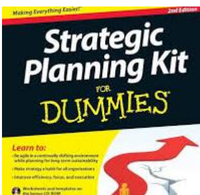
Figure Strategic Planning Kit for Dummies

A Strategic Planning Template for Dummies , A Strategic Planning Template for Dummies. This is a very simple template that may be able to assist small business organisations and not-for-profit groups to facilitate their strategic thinking and consequent planning ... Have fun and may your strategies bring you success. A Strategic Planning Template for Dummies ... edmonton.ca/public-files/assets/document?path=PDF/StrategicPlanningForDummies.pdf