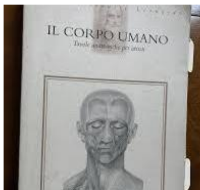
Figure Tavole Anatomiche Per Artisti Il Corpo Umano 48 Tavole Sciolte (s)

Vinci Editrice - Il corpo umano - Tavole anatomiche per ... , Ogni singola tavola presenta la numerazione, l'indicazione della parte illustrata e la sua nomenclatura anatomica; in tal modo l'utilizzo delle tavole è ... novarabellearti.it/prodotto/vinci-editrice-il-corpo-umano-tavole-anatomiche-per-artisti/