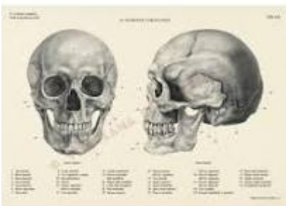
Figure Vinciana Editrice - Il corpo umano - Tavole anatomiche per ...

IL CORPO UMANO - tavole anatomiche per artisti , Ogni singola tavola presenta la numerazione, l'indicazione della parte illustrata e la sua nomenclatura anatomica; in tal modo l'utilizzo delle tavole è ... poggil825 it/prodotto/il-corpo-umano-tavole-anatomiche-per-artisti-collana-leonardo-7260011/