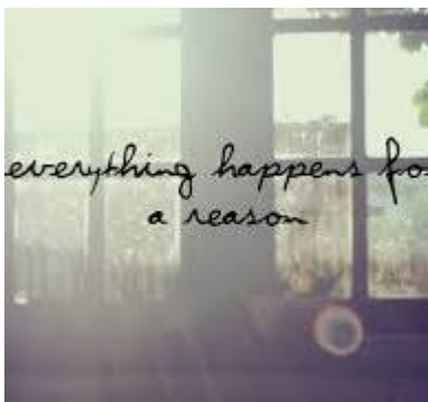
Figure Why Everything Happens For A Reason

GRATEFUL: Everything Happens for a Reason , This adult choose-your-own-adventure is equal parts black comedy and boozy business manual for the business that we call show. Actor Friend's introspection and ... amazon.com/GRATEFUL-Everything-Happens-Reason/dp/1519417292