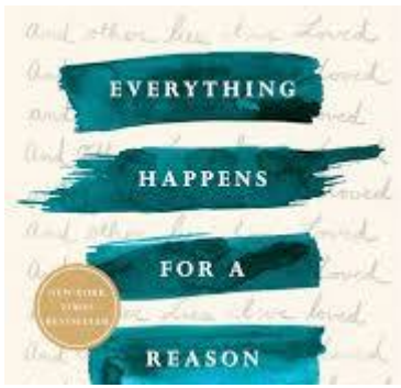
Figure EVERYTHING HAPPENS FOR A REASON: And Other Lies I've Loved ...

I believe that everything happens for a reason.... - Goodreads , “Everything happens for a reason and a purpose, and it serves you.” — Tony Robbins; “The pessimist reason that things just happen, where the ... goodreads.com/quotes/12379-i-believe-that-everything-happens-for-a-reason-people-change#:~:text=Quote by Marilyn Monroe%3A%20%80%9C,a reason%20%80%9D