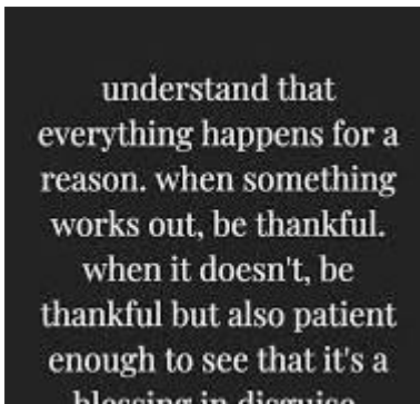
Figure Pin page

GRATEFUL: Everything Happens for a Reason , This adult choose-your-own-adventure is equal parts black comedy and boozy business manual for the business that we call show. Actor Friend's introspection and ... amazon.com/GRATEFUL-Everything-Happens-Reason/dp/1519417292