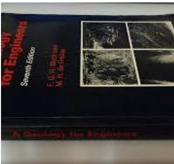
Figure A Geology for Engineers, Seventh Edition