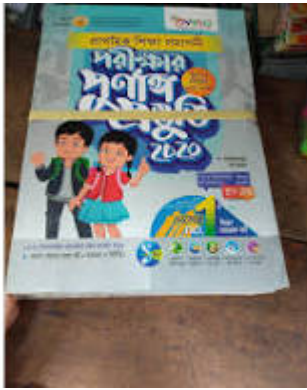
Figure Guide Book For Class Five

google.com/store/apps/details?id=com.classnotabd.class.five.math.solutions&hl=en_US