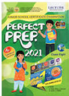
Figure Lecture Guide For Class Eight (5 Parts)

All lecture guide for class 5 , Jul 18, 2024 — preparing a lecture poorvu center for teaching and learning creating and presenting an effective lecture designing. sg1.usj.edu mo/pub/daily/data/all_lecture_guide_for_class_5.pdf